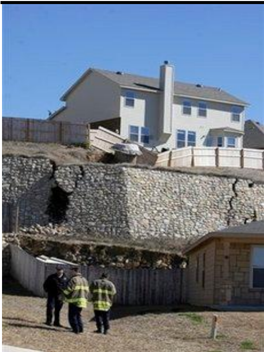
Retaining wall installed without a permit. Glad I don't live below!